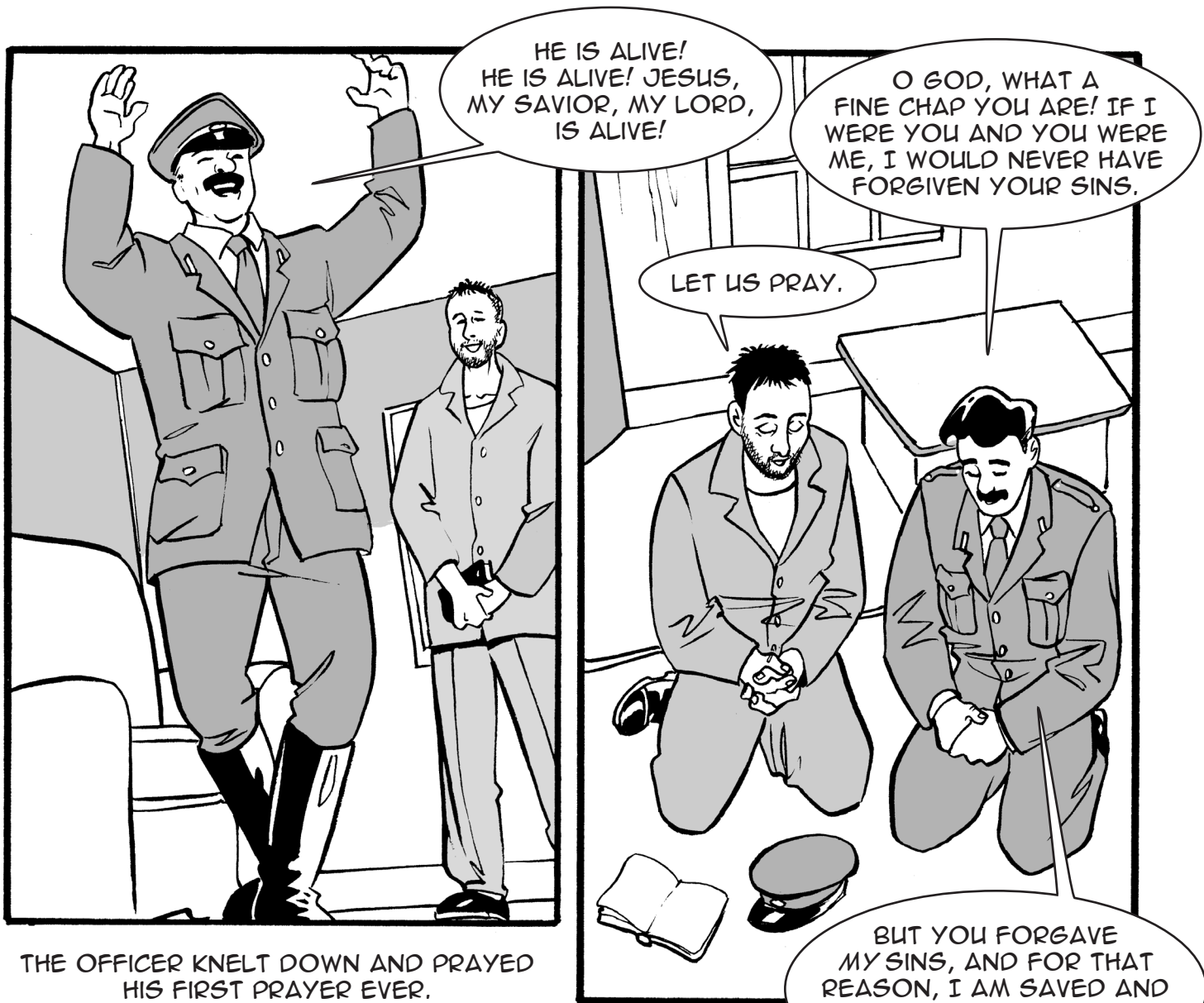
THE OFFICER KNELT DOWN AND PRAYED HIS FIRST PRAYER EVER.