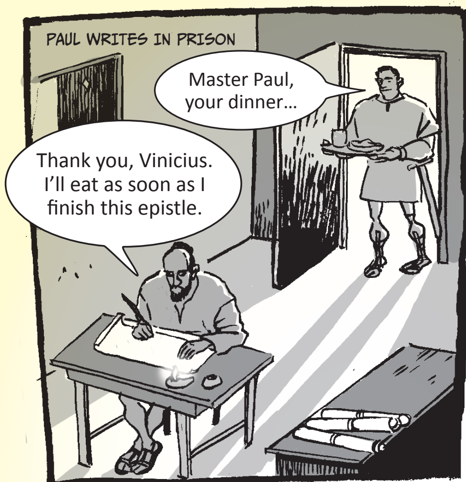
PAUL WRITES IN PRISON