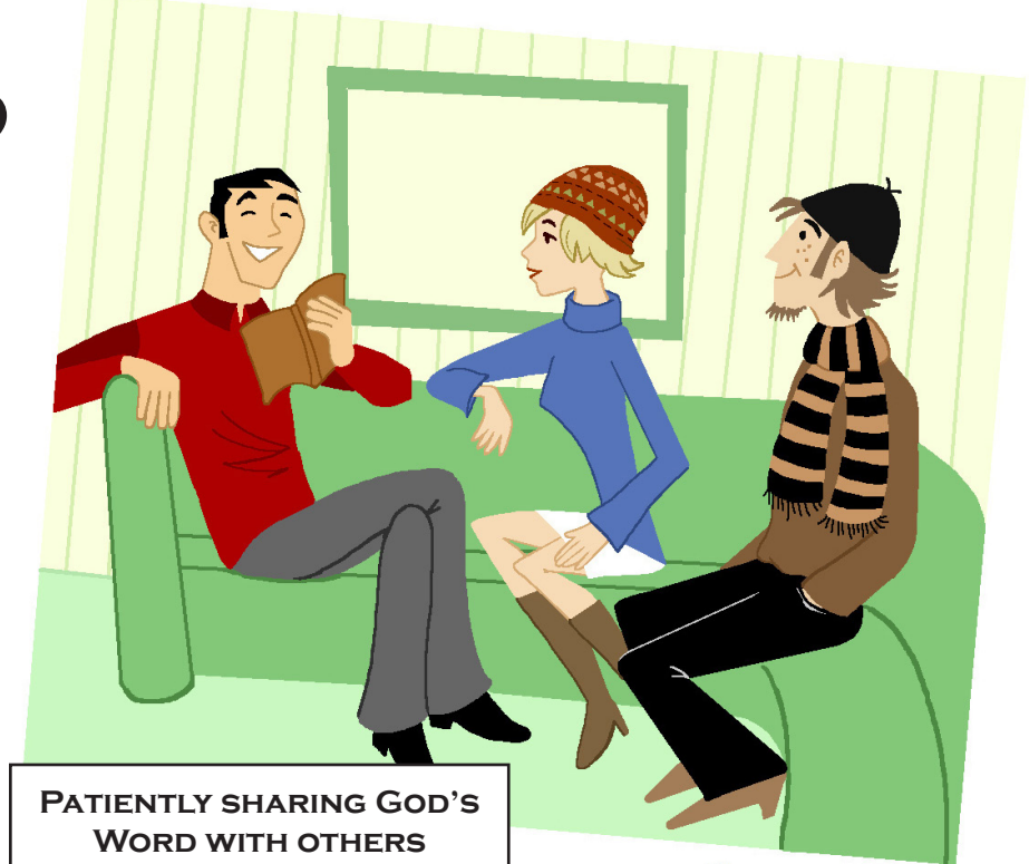
PATIENTLY SHARING GOD'S WORD WITH OTHERS

WHEN YOU ARE YOUNG, THERE IS A LOT THAT YOU'D LIKE TO DO; YOU WANT TO GO PLACES AND SEE AND DO THINGS THAT OLDER PEOPLE GET TO DO, BUT IF YOU GREW UP TOO QUICKLY, YOU WOULDN'T GAIN THE PATIENCE AND HUMILITY THAT YOU WILL NEED WHEN YOU ARE OLDER IN ORDER TO DO YOUR JOB OR INTERACT WELL WITH YOUR FRIENDS OR FAMILY.