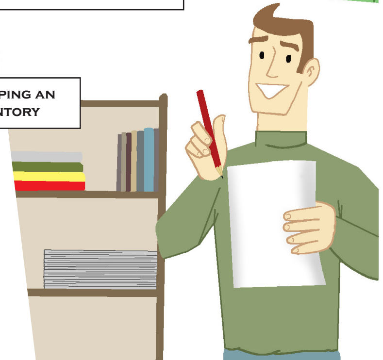
PATIENTLY KEEPING AN OFFICE INVENTORY