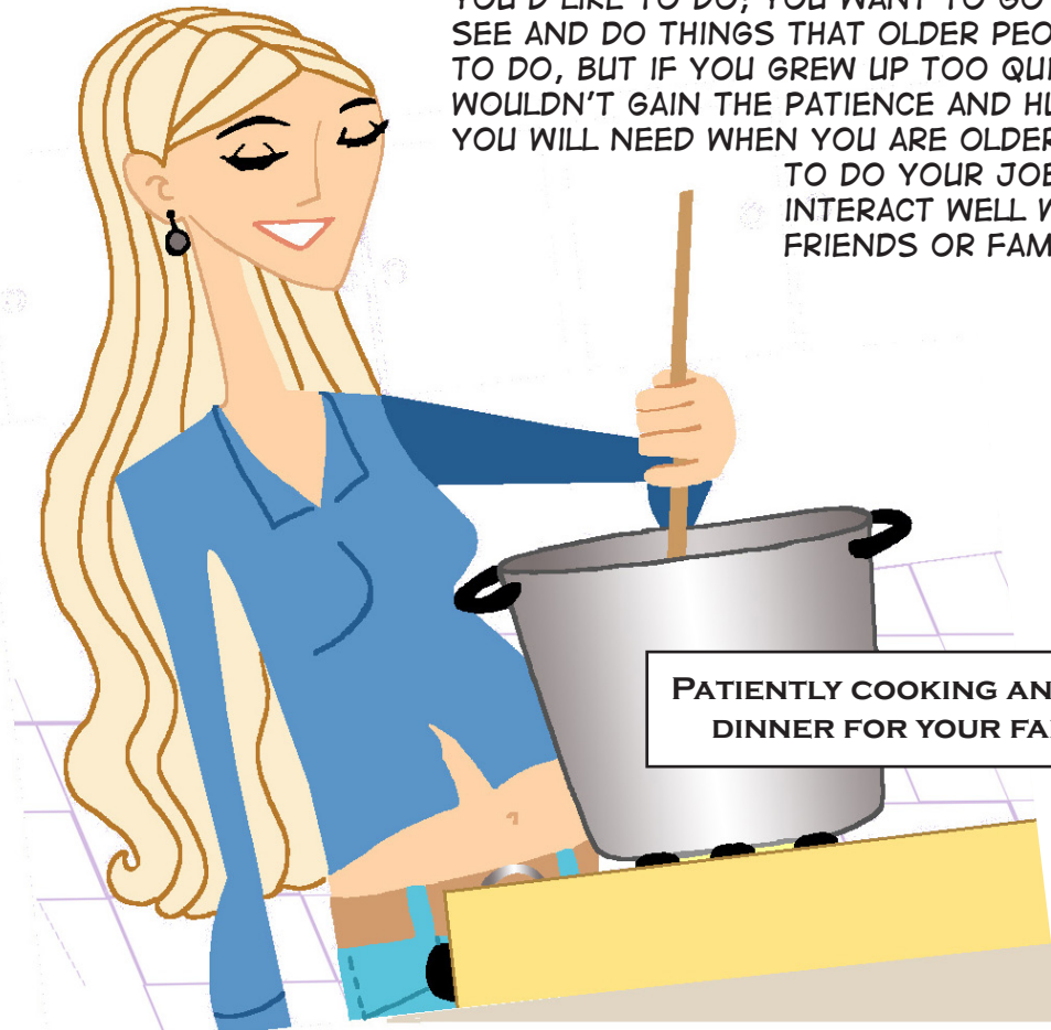
PATIENTLY COOKING ANOTHER DINNER FOR YOUR FAMILY