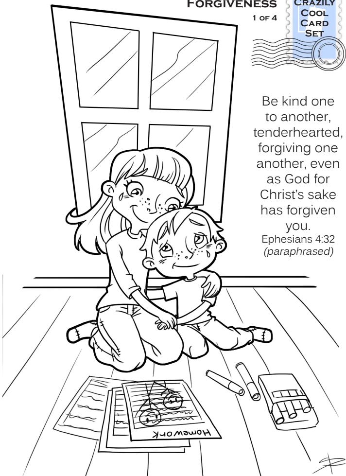
Published by My Wonder Studio. © 2012 by The Family International

Be kind one to another, tenderhearted, forgiving one another, even as God for Christ's sake has forgiven you. Ephesians 4:32 (paraphrased)