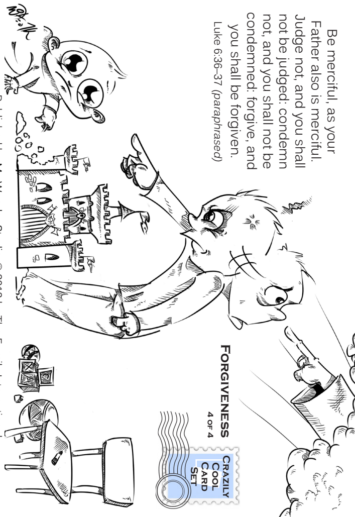
Published by My Wonder Studio. © 2012 by The Family International

Be merciful, as your Father also is merciful. Judge not, and you shall not be judged; condemn not, and you shall not be condemned; forgive, and you shall be forgiven. Luke 6:36-37 (paraphrased)