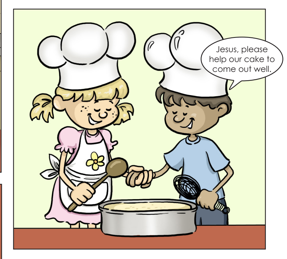
THEN THEY PRAYED THAT THEIR CAKE WOULD COOK PROPERLY.