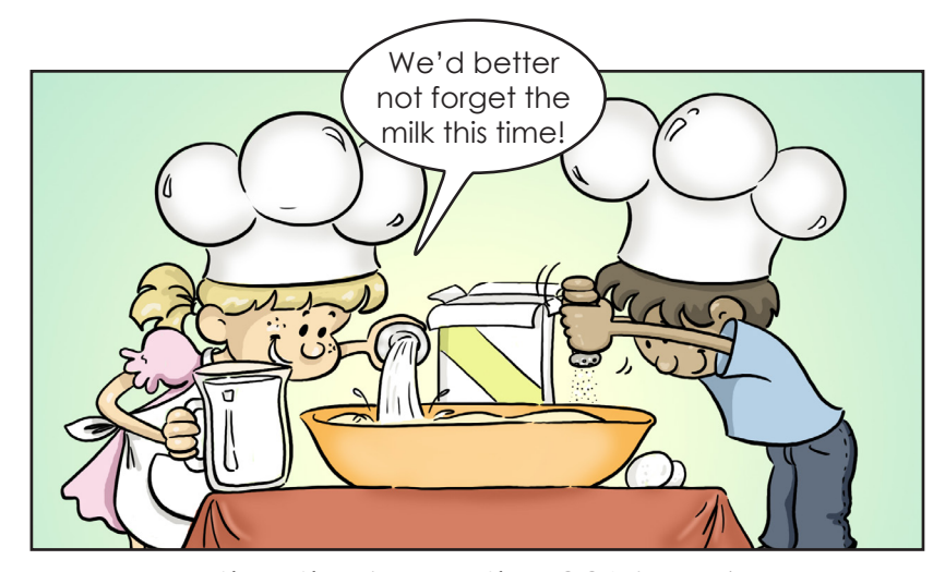
THEN THEY ADDED THE EGGS AND OIL. AND FINALLY, THEY STIRRED IN THE MILK.

"WHAT GOOD DOES IT DO TO SAY YOU HAVE FAITH IN GOD, BUT THEN NOT DO ANYTHING TO HELP SOMEONE YOU KNOW NEEDS YOUR HELP? "IF YOU HAVE FAITH, THEN YOU WILL DO SOMETHING ABOUT THE NEEDS YOU SEE. FAITH WITHOUT ACTION IS DEAD, BUT FAITH WITH ACTION IS REAL." (JAMES 2:14 AND 17, PARAPHRASED).