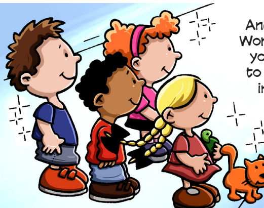
And as you study My Word and let Me teach you more about how to trust Me, that will increase your joy.

"You will keep in perfect peace all who trust in you, all whose thoughts are fixed on you" (Isaiah 26:3 NLT).